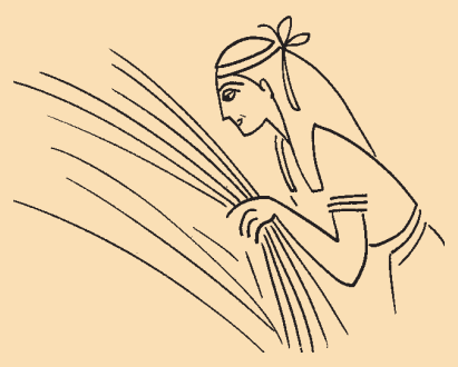
"The king's daughter ... noticed the basket" (2.5)

she saw what a fine baby he was, she hid him for three months.